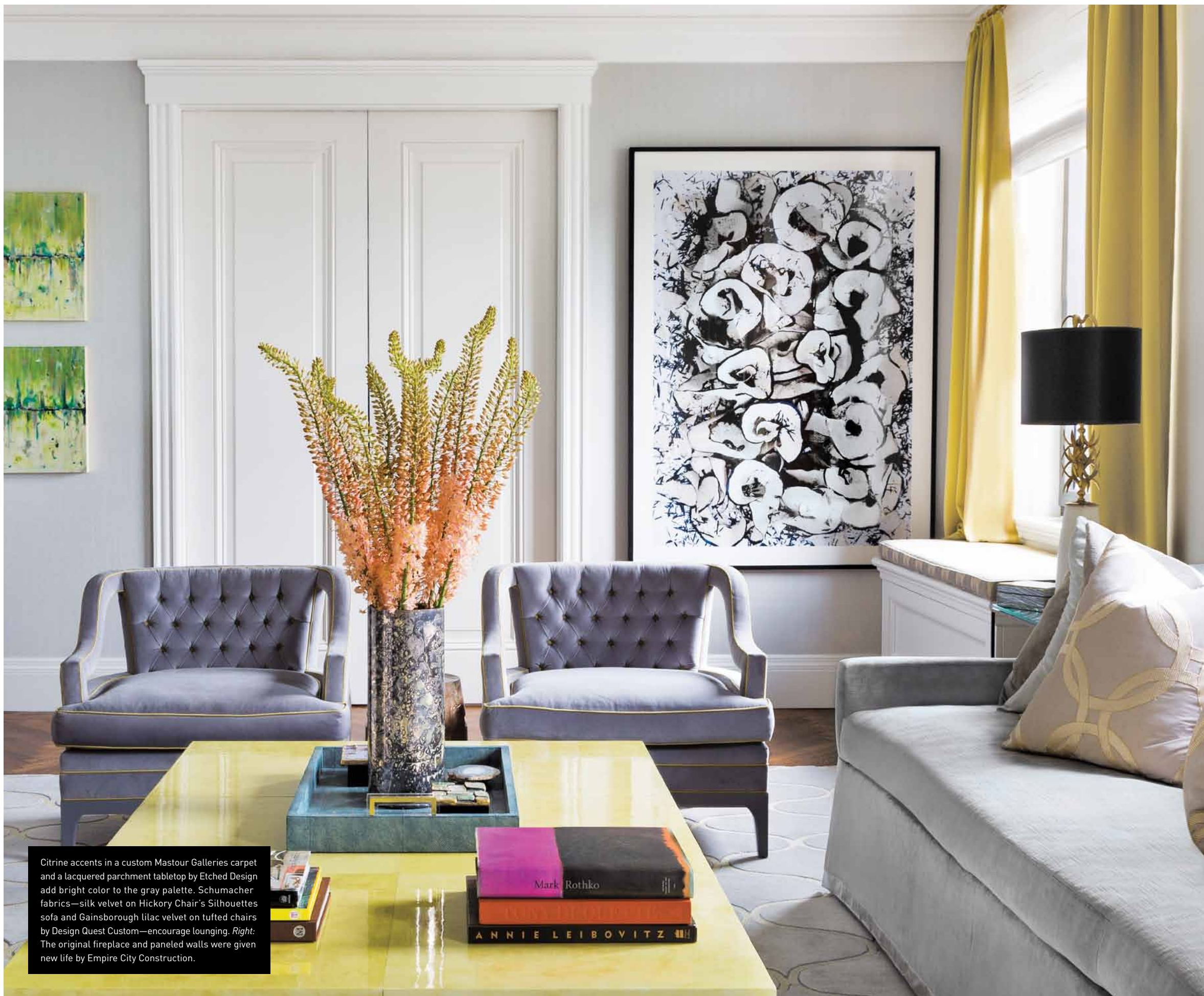
Citrine accents in a custom Mastour Galleries carpet and a lacquered parchment tabletop by Etched Design add bright color to the gray palette. Schumacher fabrics—silk velvet on Hickory Chair’s Silhouettes sofa and Gainsborough lilac velvet on tufted chairs by Design Quest Custom—encourage lounging. Right: The original fireplace and paneled walls were given new life by Empire City Construction.