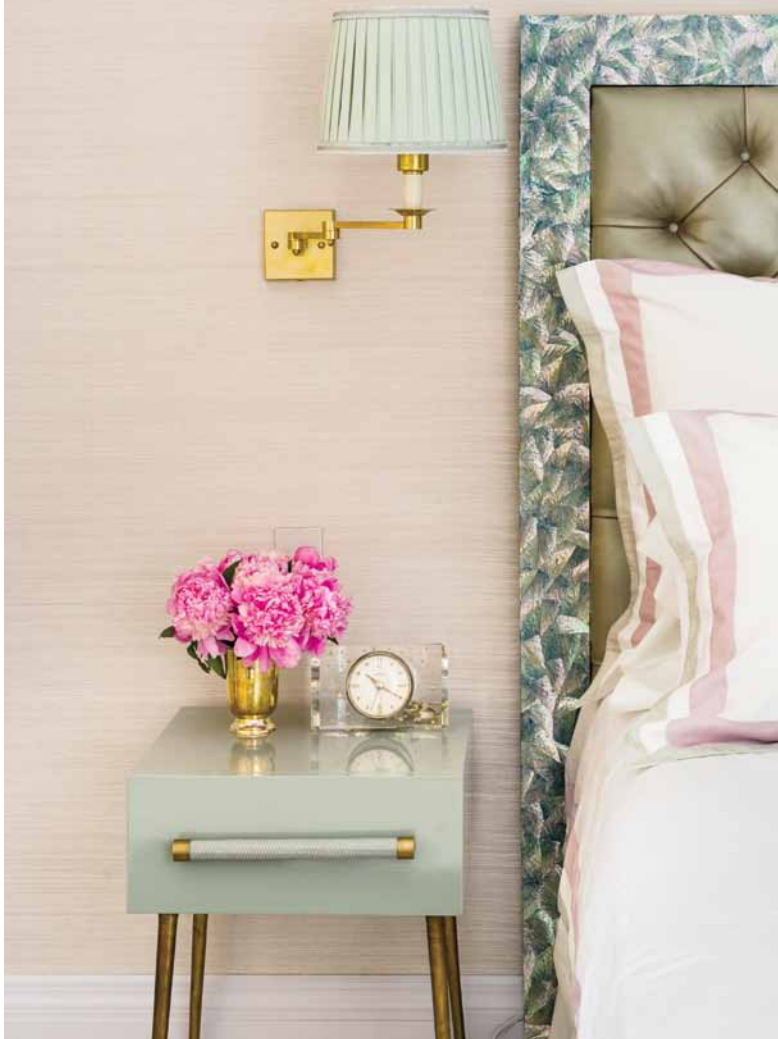
The headboard was upholstered by Jaydan Interiors using a Moore & Giles leather, and is finished with a border of abalone shell by Celestina Home. Nightstands from Chelsea Textiles have a midcentury modern vibe. The brass Visual Comfort sconces were customized with Illumé shades.